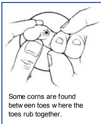
Some corns are found between toes where the toes rub together.