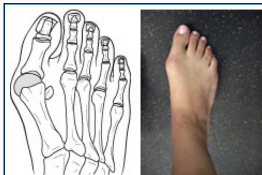
A bunion is a bony knob that protrudes from the base of the big toe.

Hammer toes occur when the toe starts to curl up instead of lying flat. The middle toe joint will bend up and if you have your foot in a tight shoe, it will rub up against the shoe surface and cause pain . In addition, the muscles that attach to the toes will continue to weaken if the foot stays in this abnormal position.