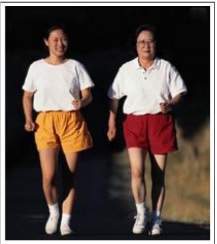
Proper exercise is key in the treatment of osteoporosis.

2200 Lake Boulevard NE • Atlanta, GA 30319 Phone: (404) 633-3777 • Fax: (404) 633-1870 www.rheumatology.org • info@rheumatology.org