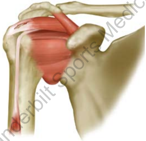
Tear in Supraspinatus tendon

Severe tendonitis from impingement, degeneration, or a sudden injury like a fall, can cause partial or complete tearing of the rotator cuff. This may result in pain, weakness and/or loss of motion.